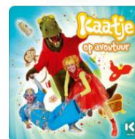
Kaatje Op Avontuur 2010