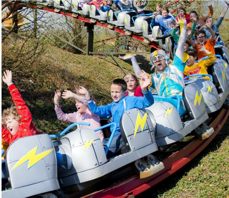
Own area in Plopsaland, De Panne (Studio 100)