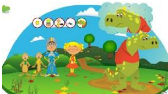
Successful and safe online environment