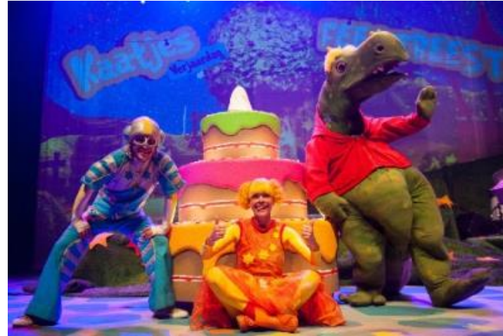
Performances on Ketnet & Plopsaland events all year long